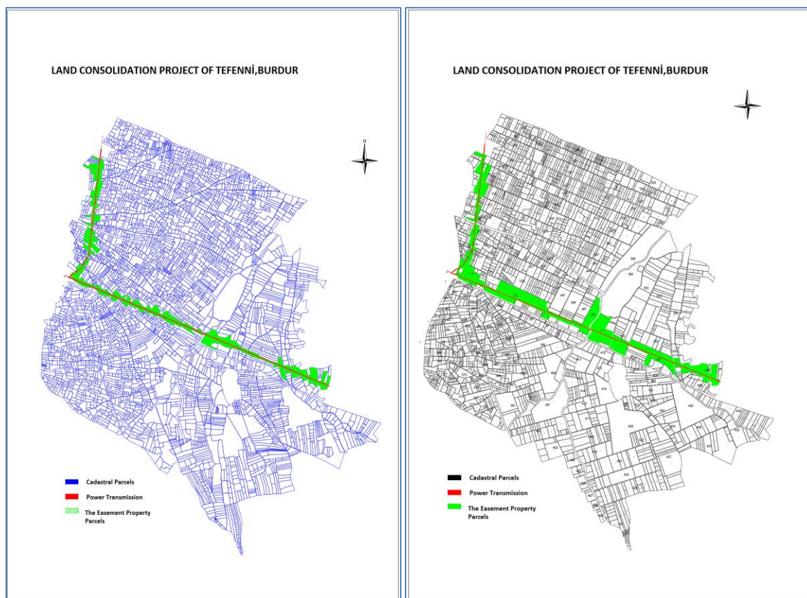
Figure 2. Cadastral map and real estates on which easement has been founded before and after LC project of Tefenni County

In these premises; the owners of 57 real estates earned income due to constitution of servitude before LC studies but they got rid of constitution of servitude thanks to application of LC project. The owners of 37 real estates; they encountered constitution of servitude after application of LC project. While restrictions are placed on their real estates, It doesn't make income against great expense (Figure 2b).